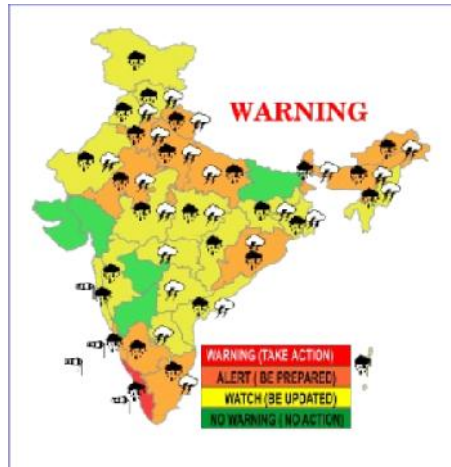
10 th Aug 2020